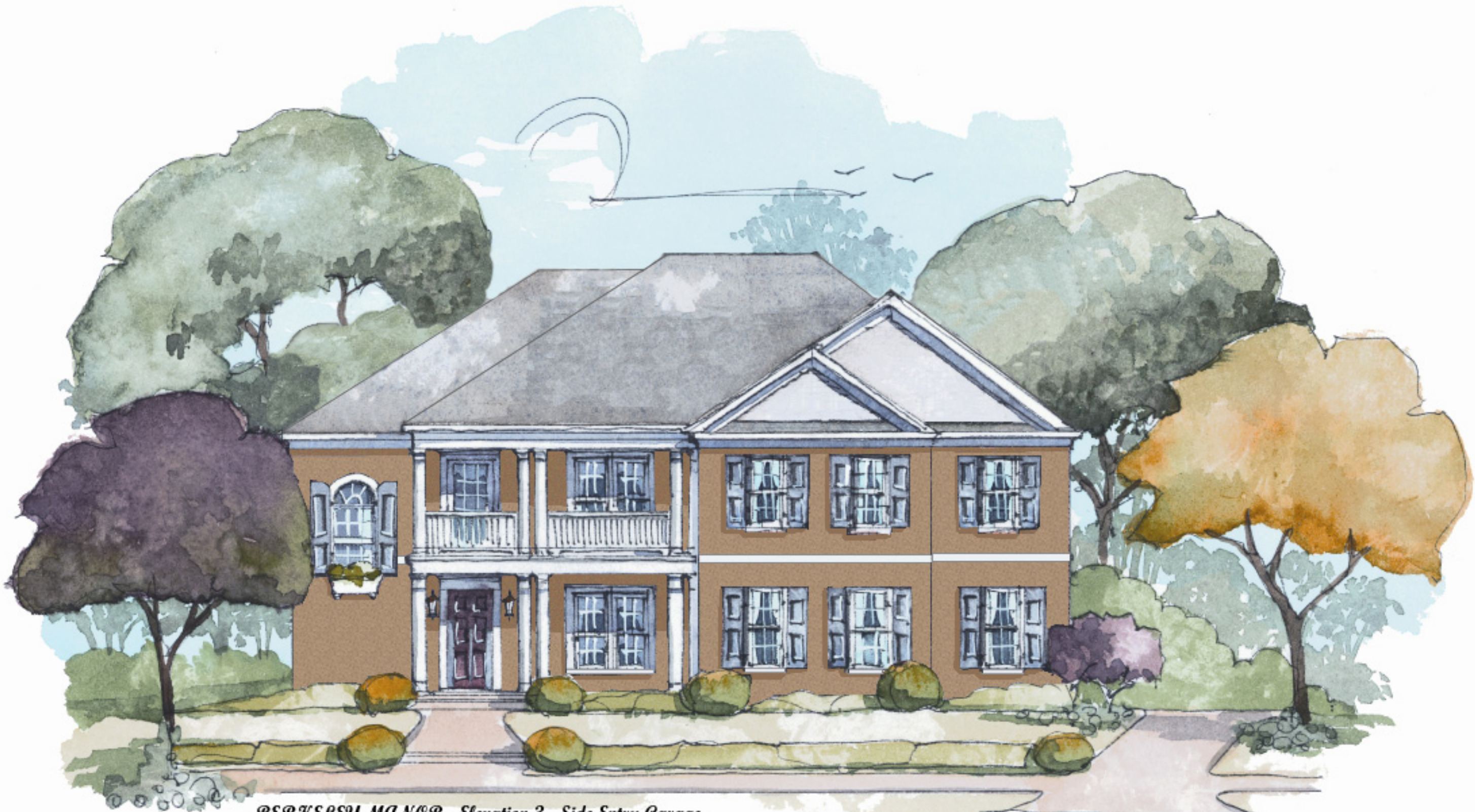
BERKELEY MANOR - Elevation 3 - Side Entry Garage

DIMENSIONS ARE APPROXIMATE. RENDERINGS AND LANDSCAPING ARE ARTIST CONCEPTION. FINAL ELEVATIONS ARE SUBJECT TO CHANGE WITHOUT NOTICE OR CAUSE.