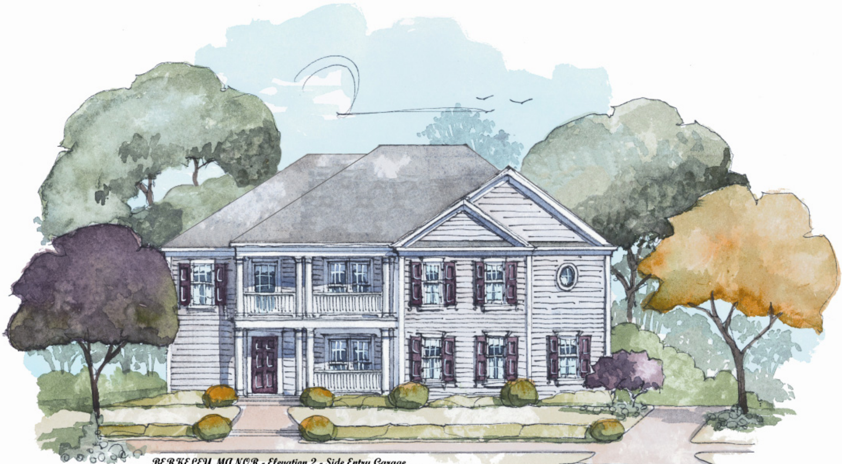
BERKELEY MANOR - Elevation 2 - Side Entry Garage

DIMENSIONS ARE APPROXIMATE. RENDERINGS AND LANDSCAPING ARE ARTIST CONCEPTION. FINAL ELEVATIONS ARE SUBJECT TO CHANGE WITHOUT NOTICE OR CAUSE.